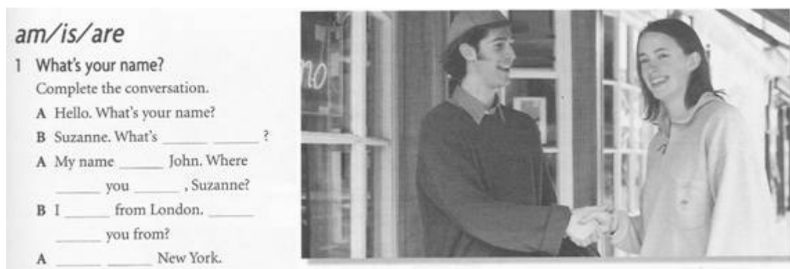
Figure 3 – American Headway 1A: Workbook, p. 1 (detail)

The other point is that textbooks are not restricted to a collection of drills and exercises. They typically present other activities as well, of which drills are just a part, although a substantial one in some cases. Drill variability and the use of drills as integrated with other activities are usually not taken into account, however, when drills are criticized.